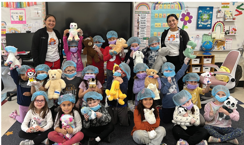
Nurses conduct a Teddy Bear Clinic, where bicycle, helmet, and car safety are reviewed.