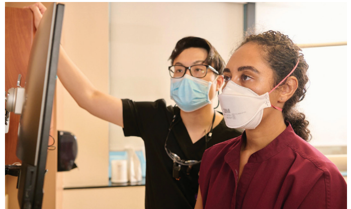
Dental residents at the NYU Langone Hospital—Long Island campus reviewing a patient's radiographs.

NYU Langone Dental Medicine is a workforce pipeline for safety net clinics, with many alumni returning to work in the health centers where they trained. Some accept positions with NYU Langone Dental Medicine immediately following graduation while others return years later.