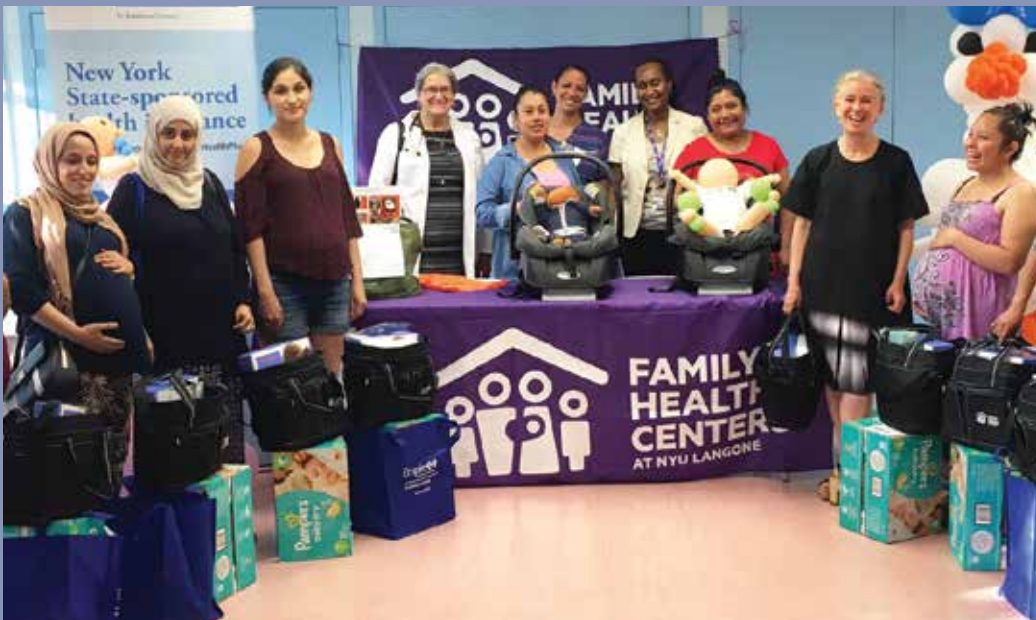
At a July 2017 group baby shower, we surprised new moms with gifts of assorted baby products.

Note: Participants at a shared medical appointment agree not to disclose other patients' medical information they may hear at the appointment.